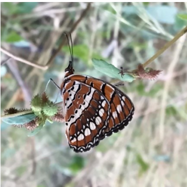
Fig.1: Byblia ilithyia ventral view

Wikipedia: Karoonjhar mountains. Retrieved on: 24th February, 2020 from: https://en.m.wikipedia.org/wiki/Karoonjhar_Mountains .